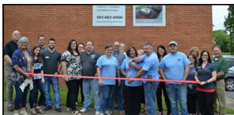
Innovative Concrete Systems