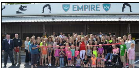
Empire Cheerleading of Arkansas