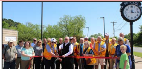
Benton Lions Club Dedication of City Hall Clock