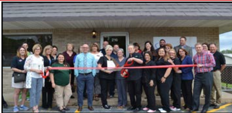
Benton Dental Center