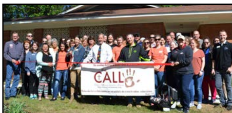
The CALL of Saline & Perry Counties